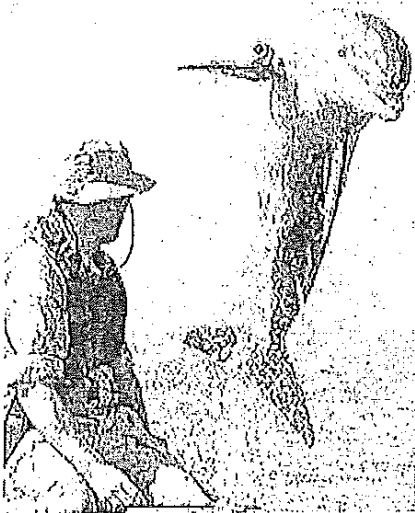
K-Dog, a bottlenose dolphin, has a camera attached to its flipper to record underwater objects. 2003.

This dolphin is helping soldiers. How? It looks for hidden objects on the ocean floor. Other animals help people too. Jump inside to learn all about them!